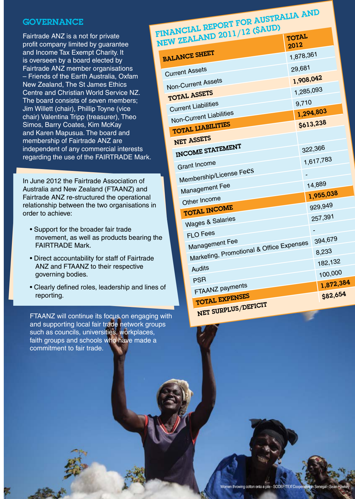
Women throwing cotton onto a pile - SODEFITEX Cooperative in Senegal - Sean Hawkey